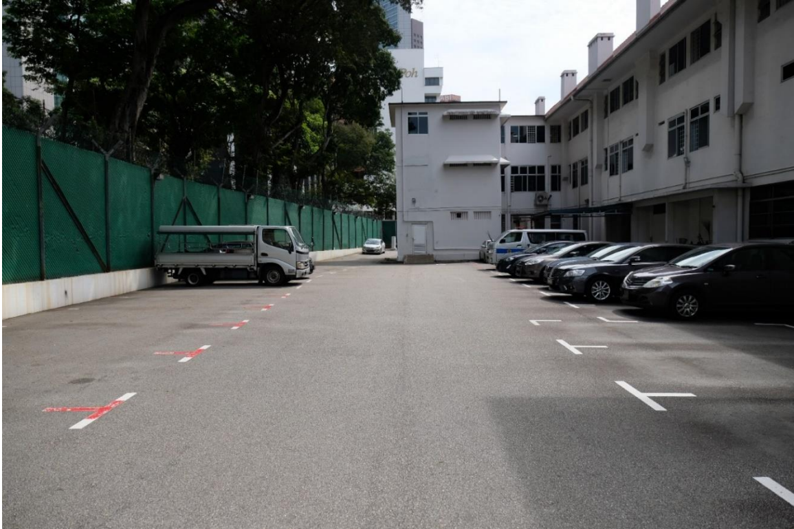
Carpark of the old Customs Operations Command located at Keppel Road.