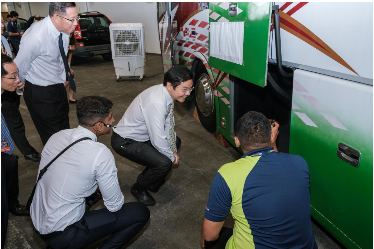
Minister Lawrence Wong being shown by Customs staff how contraband cigarettes could be hidden in various compartments of a bus.