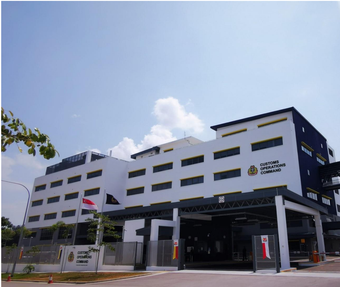
The new Customs Operations Command (COC) at Bulim Drive