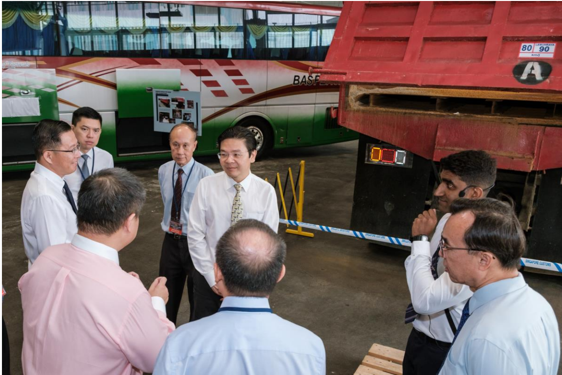
Minister Lawrence Wong chatting with Customs staff and guests.