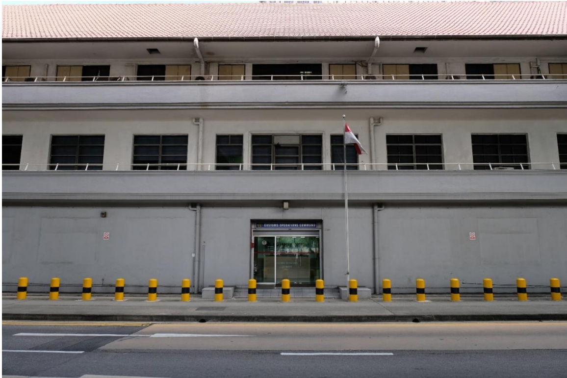
The old COC located at Keppel Road from 1940 to 2019