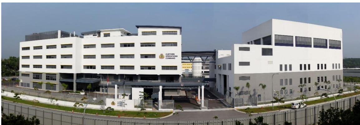
The purpose-built COC has a total gross floor area of about 21,000 square metres.