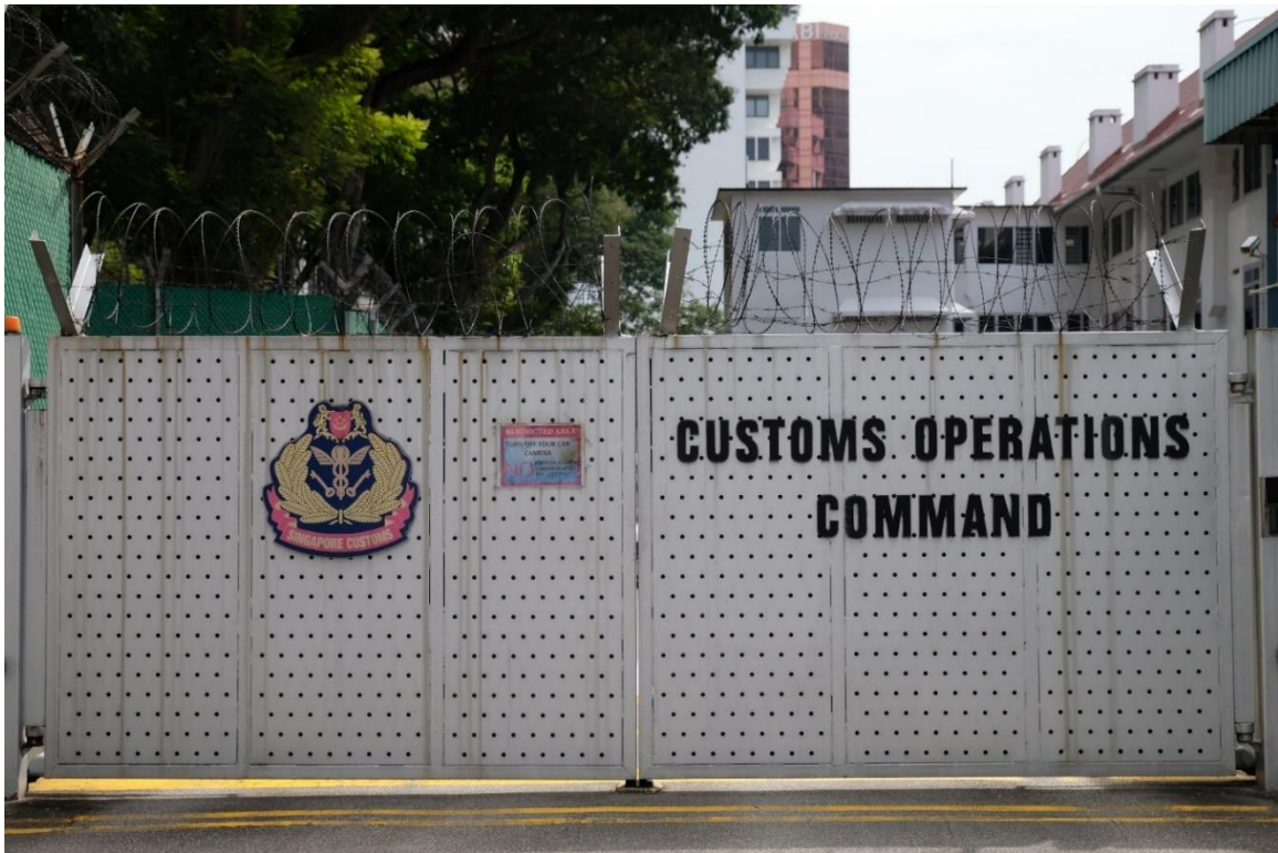
The old COC located at Keppel Road from 1940 to 2019.