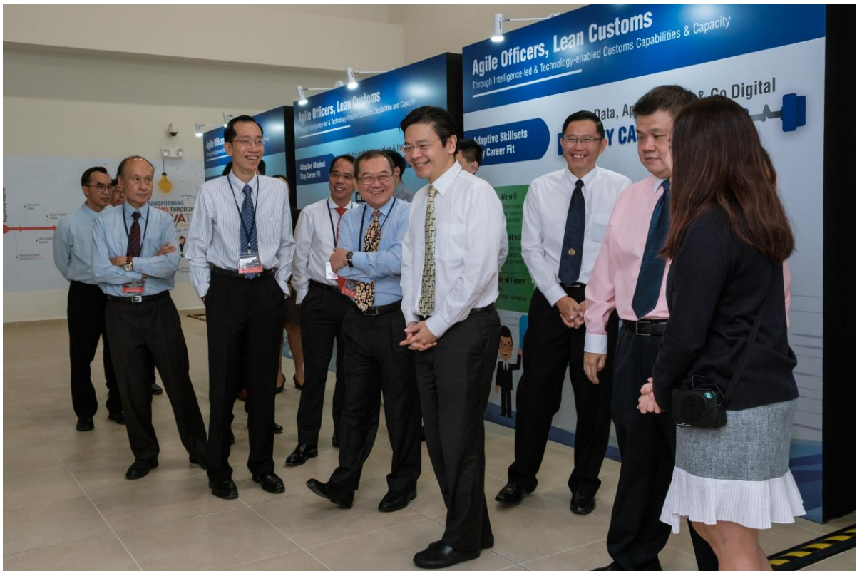
Minister Lawrence Wong interacting with Customs staff and guests at the opening ceremony.