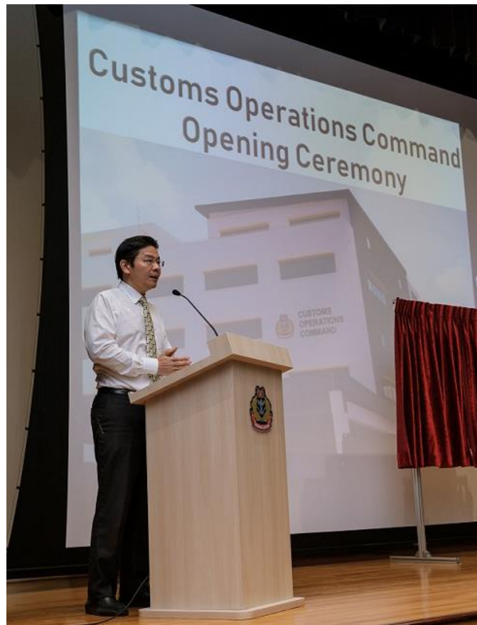
Mr Lawrence Wong, Minister for National Development and Second Minister for Finance, delivering his speech at the opening of the new COC.