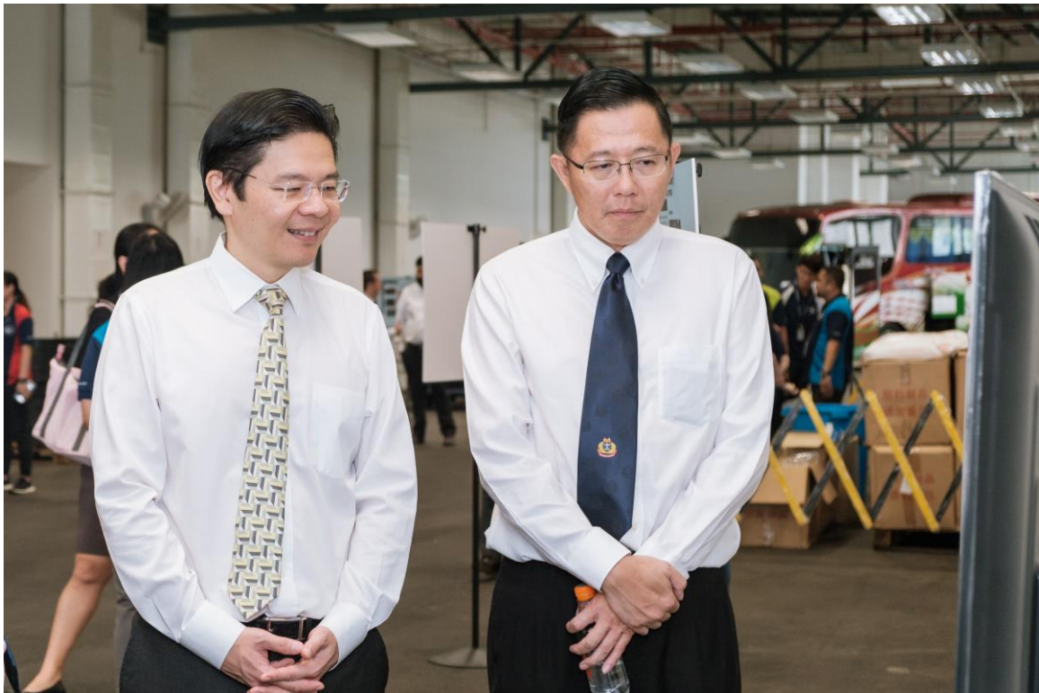
Minister Lawrence Wong viewing exhibits at the covered shed of the new COC.