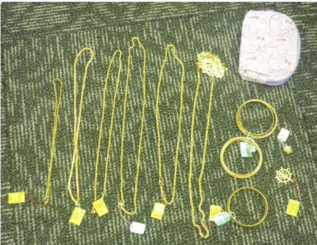
The jewellery found in the pouch.