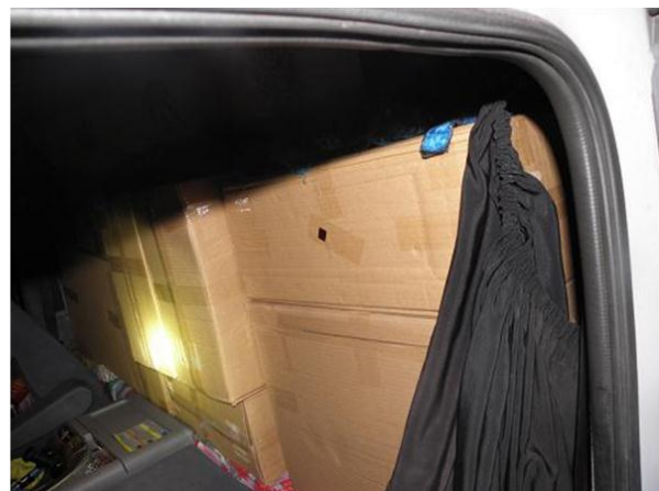
Boxes of contraband cigarettes were found hidden in the space behind the driver's seat in the three prime-movers.