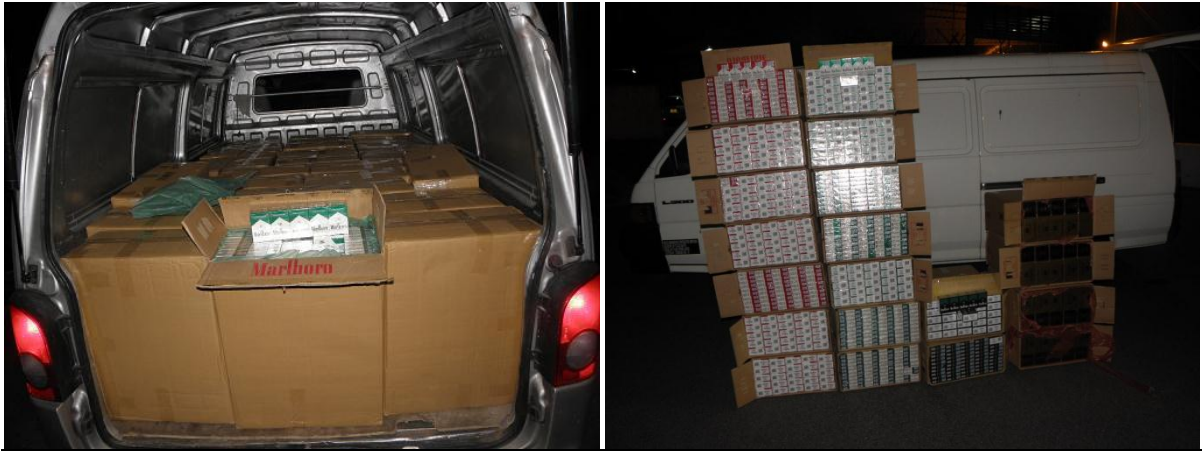
Boxes of contraband cigarettes recovered from one of the vans.