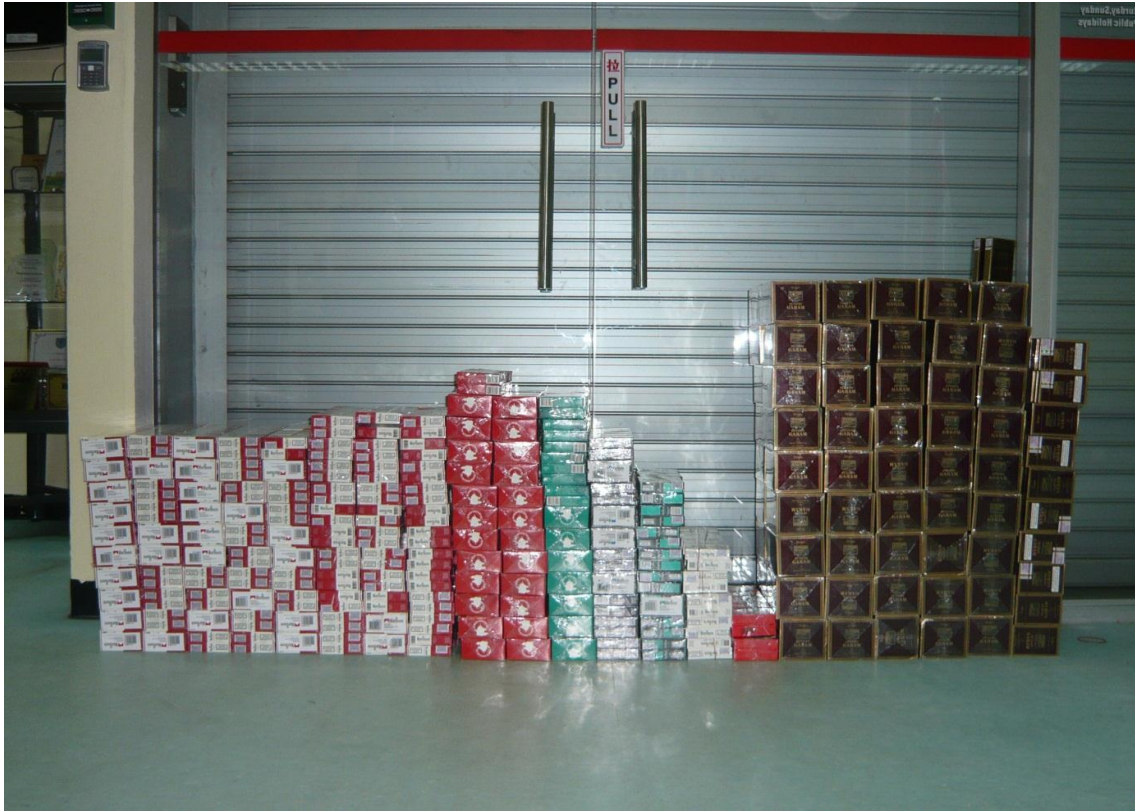
A total of 245 cartons of duty-unpaid cigarettes were recovered from the car.