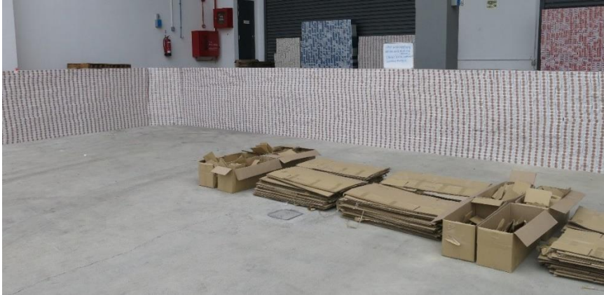
Duty-unpaid cigarettes seized on 18 September 2019