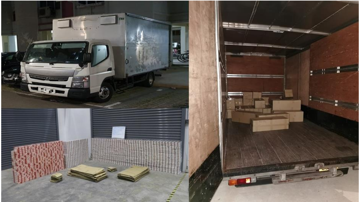
Duty-unpaid cigarettes uncovered in the truck in Woodlands Street 13