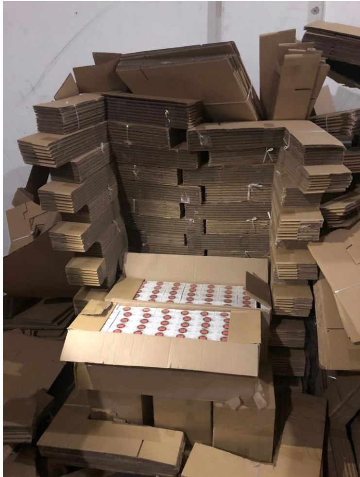
Duty-unpaid cigarettes found in the warehouse unit in Bukit Batok Crescent