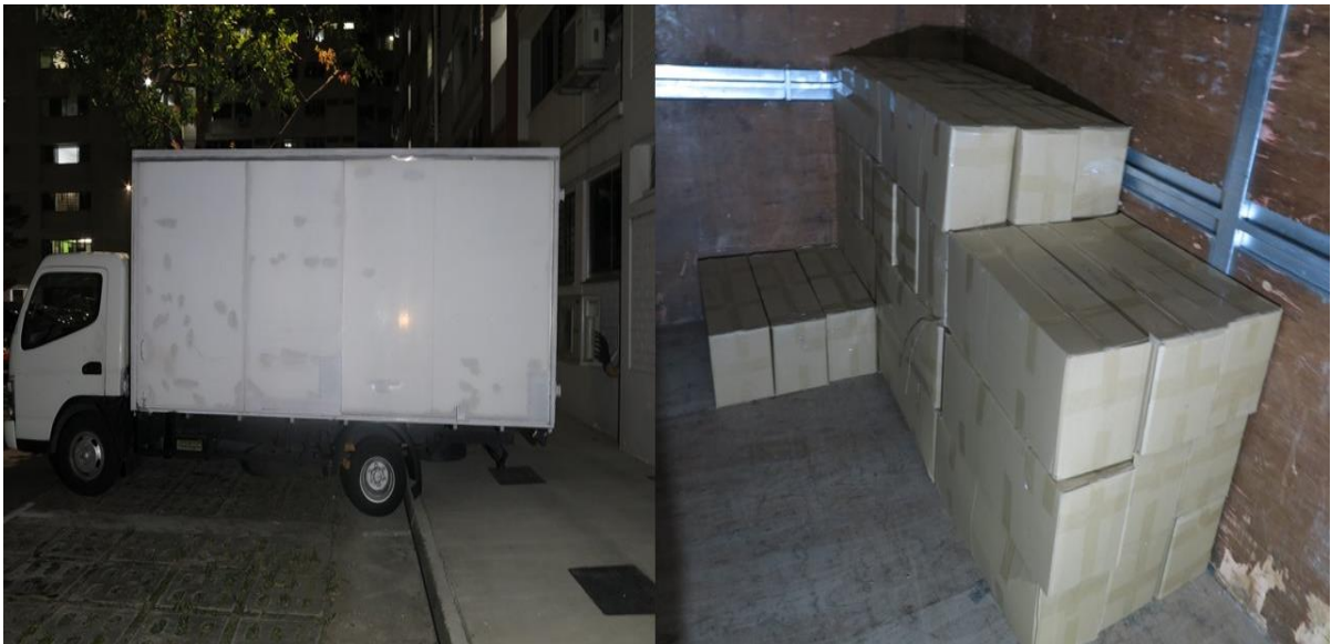
Duty-unpaid cigarettes found in the trucks in Choa Chu Kang Ave 2 and 3