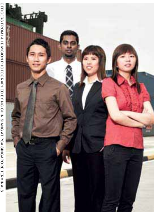
OFFICERS FROM I & I DIVISION AT PSA SINGAPORE TERMINALS