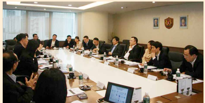
Singapore Customs hosted the Chinese delegation at Revenue House.

On 17 January 2014, Singapore Customs hosted a visit by the China (Shanghai) Pilot Free Trade Zone Administrative Committee.