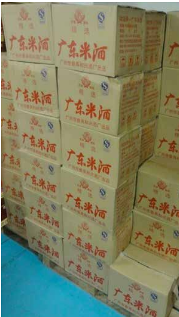
Cartons of duty-unpaid rice wine were also found on the company's premises.

A former company director was sentenced by the court on 14 April 2014 to a fine of $1,957,000 (or in default 29 months and three weeks' jail) for his role in importing duty-unpaid beer and rice wine.