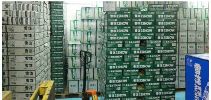
Singapore Customs officers found duty-unpaid beer in Qi Shuai's company premises.

Another 1,766 bottles and 4,025 cans of duty-unpaid beer and 120 bottles of duty-unpaid rice wine were also seized from Qi's company premises as he could not produce documents to show that duty and GST for these goods had been paid.