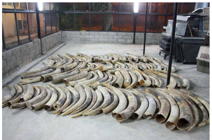
Singapore Customs and AVA officers recovered 106 pieces of ivory from 15 wooden crates in the container.

Under the Singapore Endangered Species (Import and Export) Act, a permit is required to import and export/re-export any elephant and its parts and products including ivory. The penalties for illegal trade in ivory is a maximum fine of $50,000 per scheduled specimen (not exceeding an aggregate of $500,000) and/or imprisonment of up to two years. The same penalties apply to any transshipment of ivory through Singapore without proper CITES permits from the exporting/importing country.