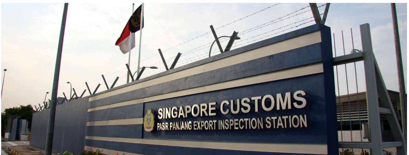
The Export Inspection Station (EIS) at Pasir Panjang started operations on 1 April 2013 to identify and target high-risk export containers for x-ray scanning and inspection.

To expedite the inspection process, new measures include the option to authorise the prime mover driver to witness the inspection, and issuing an inspection notification form to the driver. Singapore Customs also implemented unique Customs ISO 17712 compliant High Security bolt seals to reseal the container after inspection.