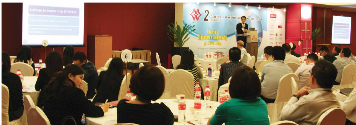
The biennial conference was attended by stakeholders in the container trade, logistics, transportation services, shipping, and supply chain communities.