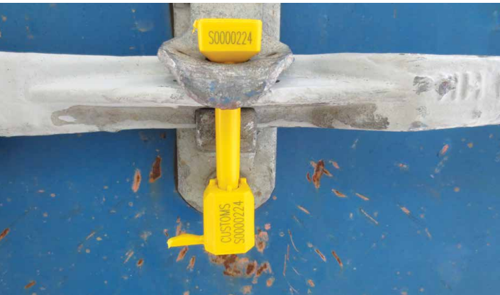
Singapore Customs implemented unique Customs ISO 17712 compliant high security bolt seals to reseal the container after inspection.

With the new procedures in place, inspection times for export checks were cut down to approximately 35 minutes, one-fifth of the time needed compared to 180 minutes previously when surveyors had to make their way down to the EIS.