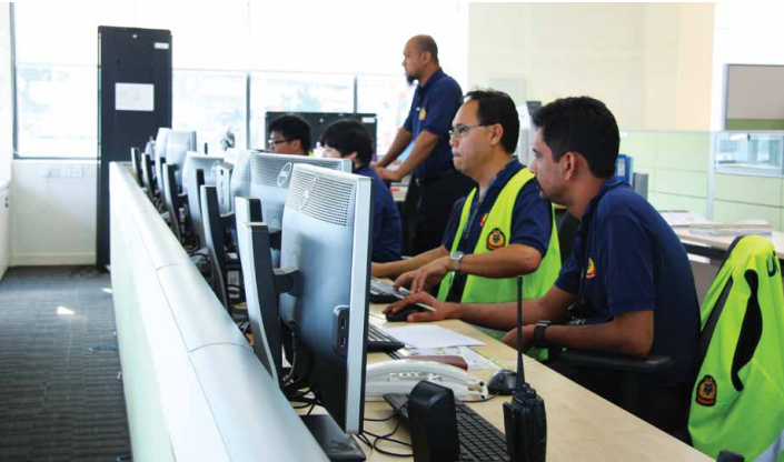
Trained sea export officers analyse x-ray images and documentation to detect any anomalies in the cargo.