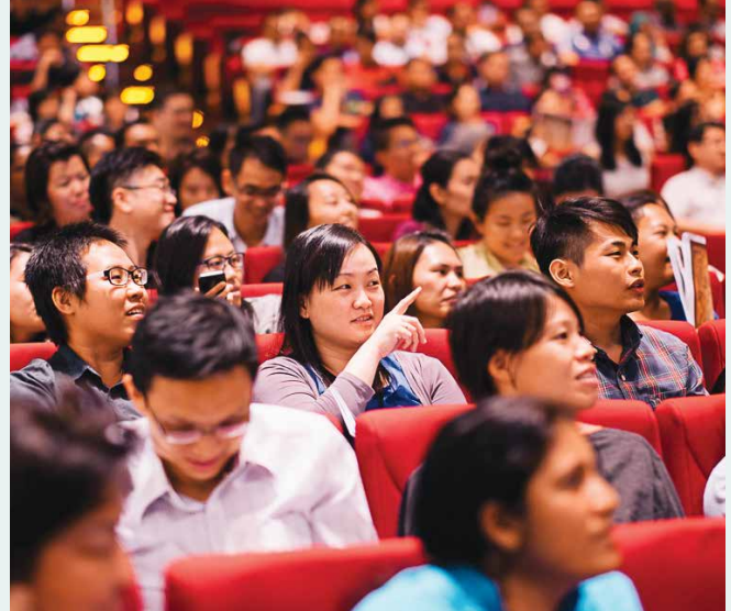
Singapore Customs staff attended the annual Customs Exchange and were given an update on the revised Service Excellence Framework.

The new Service Excellence Framework aims to know customers, understand them, and wow them, through various methods like refining listening and learning channels, instilling a partnering mind set in staff, customising facilitation and service offerings, and empowering staff to go the extra mile.