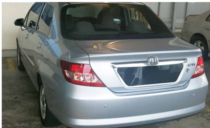
Singapore Customs officers seized the Malaysian-registered car (above) that was used to smuggle duty-unpaid cigarettes into Singapore at Woodlands Checkpoint.