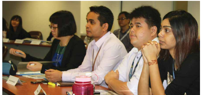
Participants learnt about risk assessment methodology, data analytics, targeting protocols, and performance measurements.