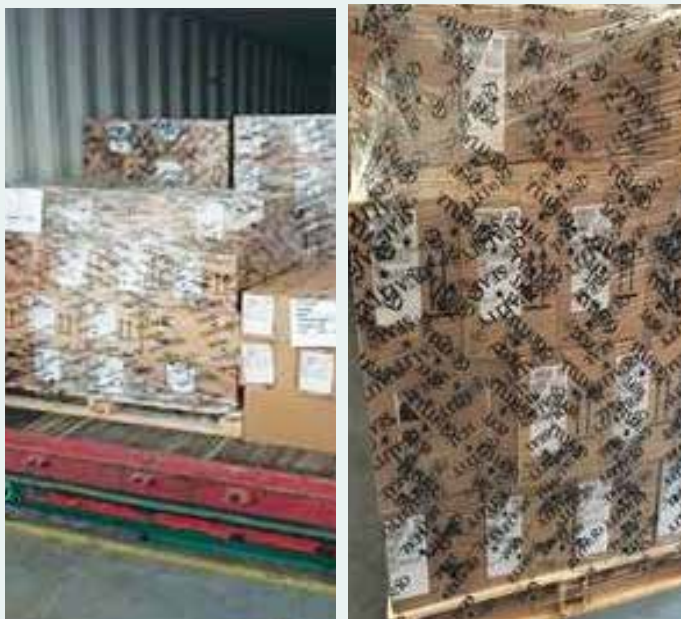
Singapore participated in the operation from 5 to 16 May 2014 for the ports, physically checking the targeted containers suspected to have counterfeit perfumes.

Singapore Customs is an active participant of international IPR mutual enforcement operations, and believes that the enforcement against counterfeit goods is the responsibility of all players in the global supply chain. Singapore authorities adopt a whole-of-government approach towards IPR enforcement. Agencies such as Singapore Customs and the Singapore Police Force work closely to protect the borders and domestic market against counterfeit goods.