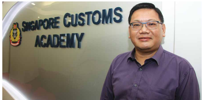
Mr Chia's paper was included in the World Customs Organisation repository of best practices, and will be used in guides on single windows.

According to Mr Zhu, Mr Chia's paper will be used in WCO Guides like the 'Single Window Compendium'.