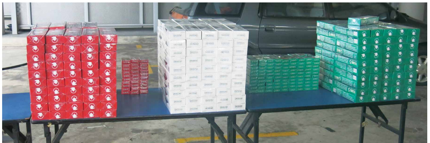
A total of 298 cartons and 210 packets of duty-unpaid cigarettes were recovered from the car.