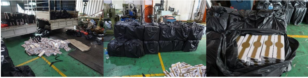
Duty-unpaid cigarettes found in the industrial unit at Tuas View Square.