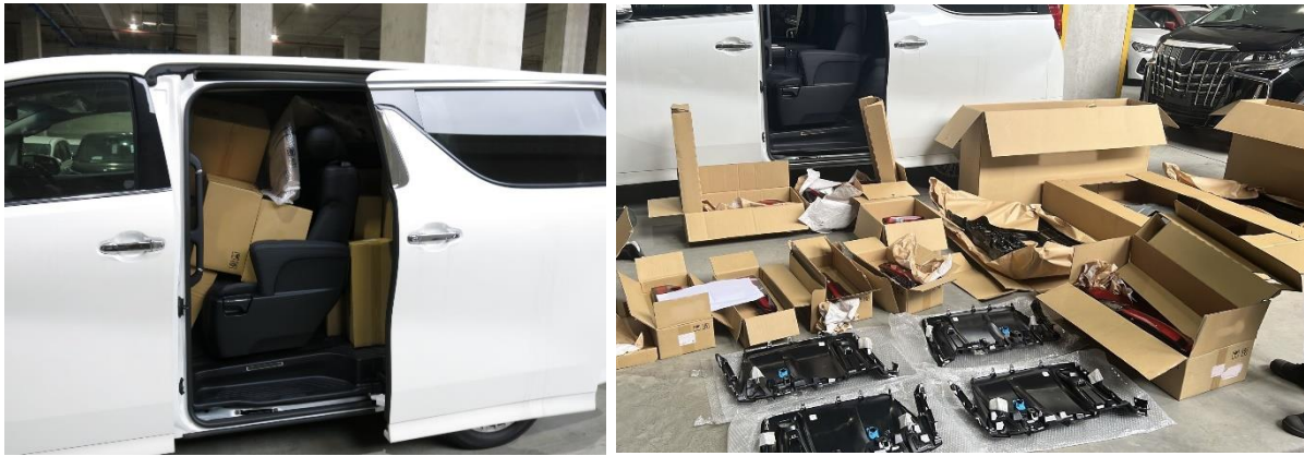
New vehicle spare parts found inside motor vehicles in the LW operated by Trans Point Agency.