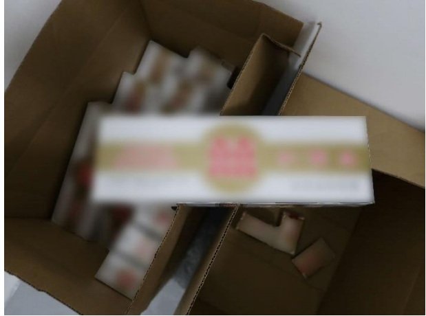
Duty-unpaid cigarettes found in the industrial unit at Gambas Crescent