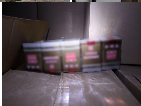
Duty-unpaid cigarettes found in the truck at Gambas Crescent