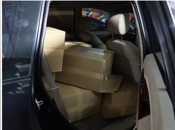
Duty-unpaid cigarettes found in the car at Choa Chu Kang Crescent