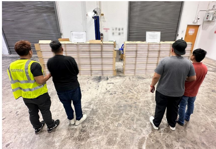
Two of the men arrested and the duty-unpaid cigarettes seized.