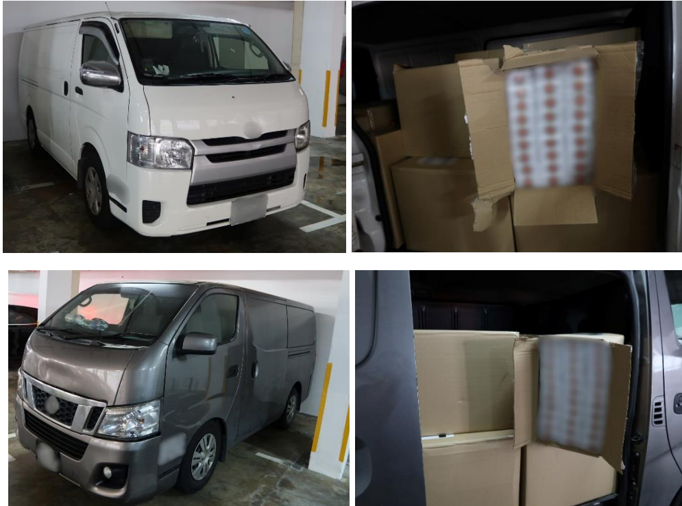
Duty-unpaid cigarettes found in the two vans.