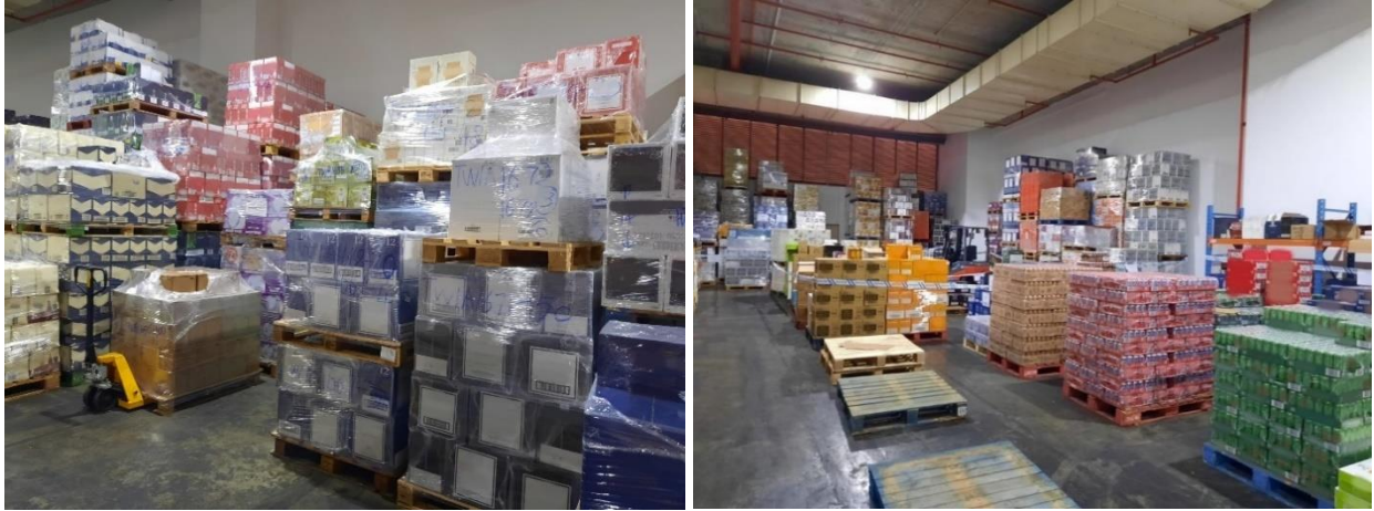
Liquors found on the premises of TWI and Kingsman.